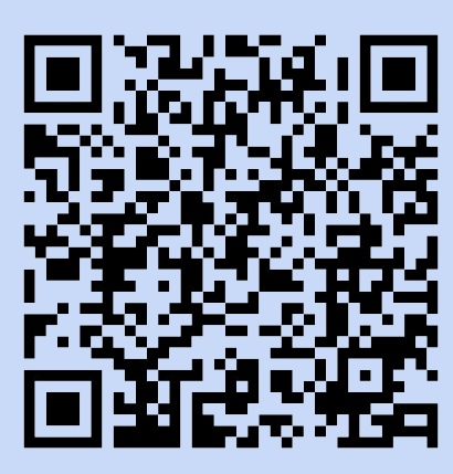
Online Registration OR Code