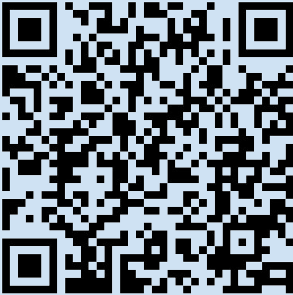
Online Registration QR Code